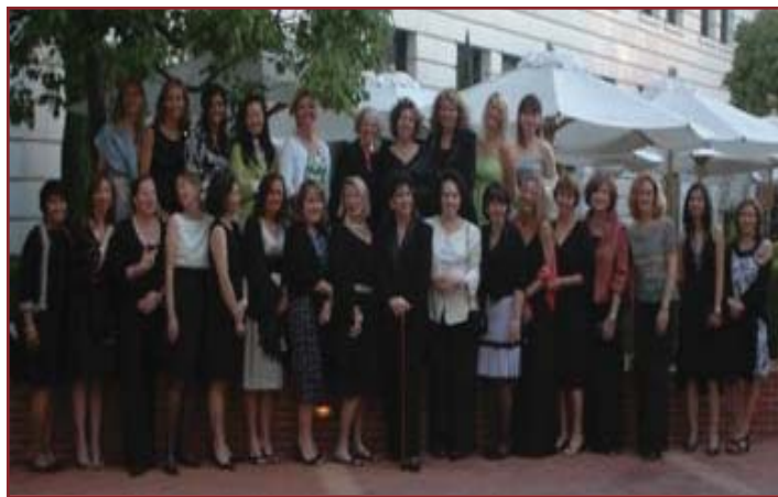
Society of University Neurosurgeons Spouses