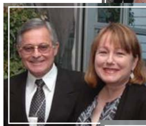
Conference attendees enjoy visiting during dinner